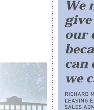
: Leasing Excellence Awards (Sales & Leasing Group) Recipients

We must never give up on our dreams because if we can dream it. we can do it.