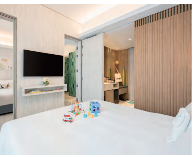
A family room at Village Hotel at Sentosa