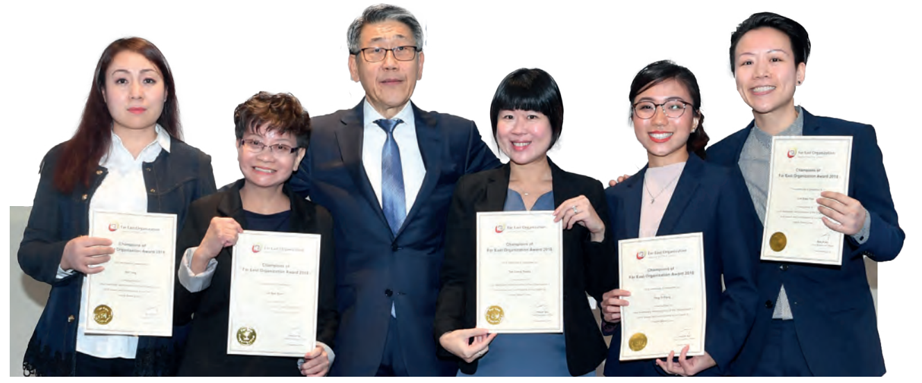
Champions of Far East Organization Award Recipients