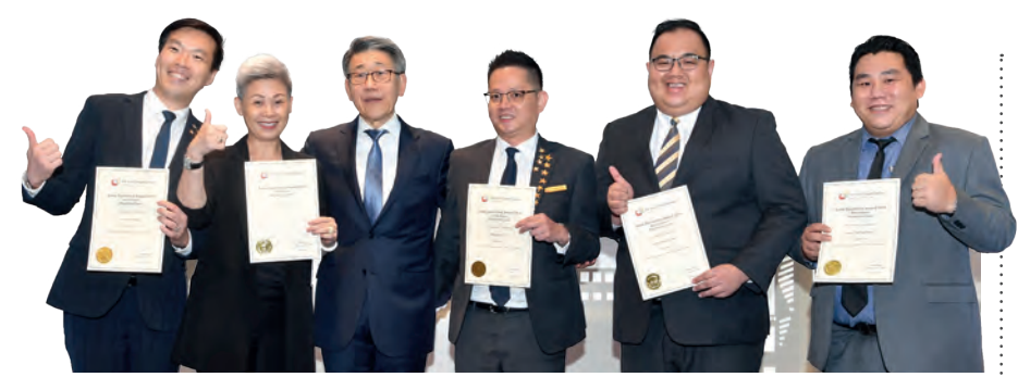
Sales Excellence Awards (Sales & Leasing Group) Recipients

Always believe in God's plans. When He is silent, He is preparing something special for you. So stay positive and embrace the changes.